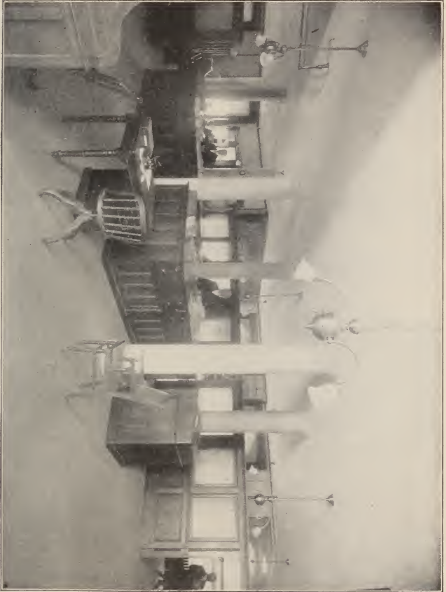
OFFICES OF THE AMERICAN BOARD.

In this building the American Board occupies the rear half of the seventh floor, which is reached by swift elevators. The door of entrance upon this floor is No. 708, on opening which the visitor will have the view presented in the engraving. The large room is somewhat obstructed by